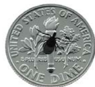
Adult deer tick, less than 5/32 inch.